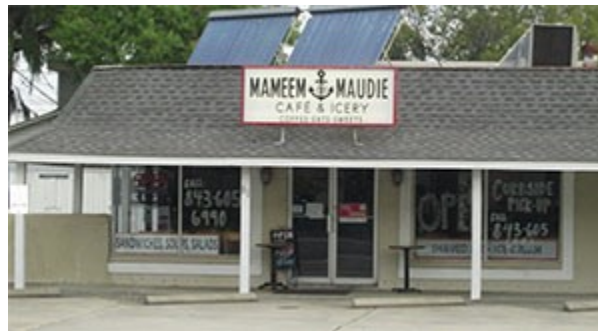
Where Gaucho's used to be