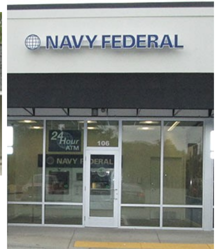
Next to Jersey Mike's by Walmart